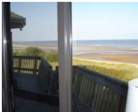
Amazing View from Studio Apartment #5