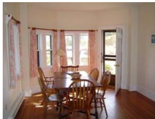
Spacious Dining Room in Apartment #3