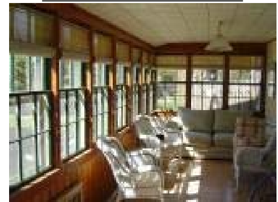
Lovely Sun Porch at 131 Linnell